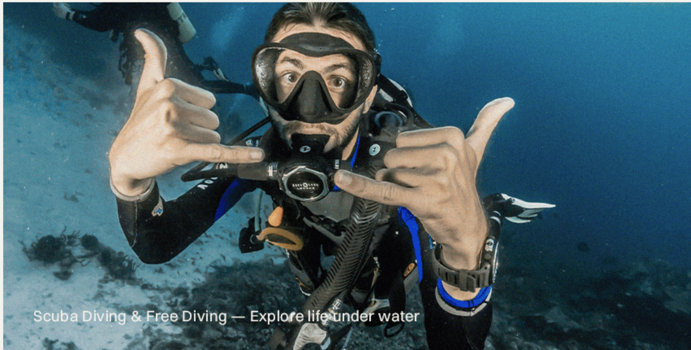
Scuba Diving & Free Diving — Explore life under water