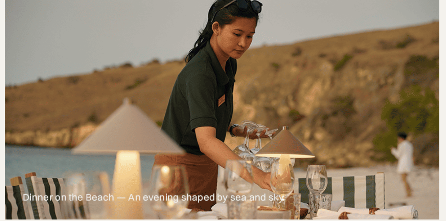
Dinner on the Beach — An evening shaped by sea and sky