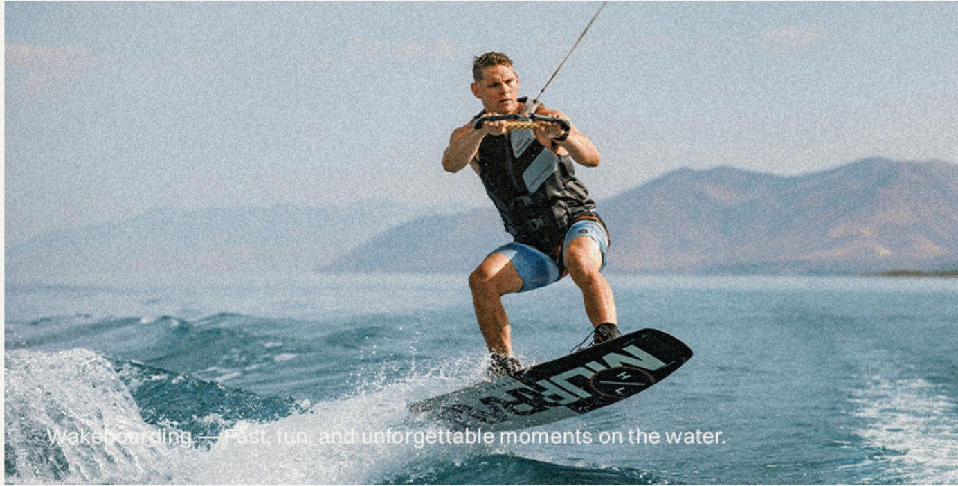
Wakeboarding — Fast, fun, and unforgettable moments on the water.